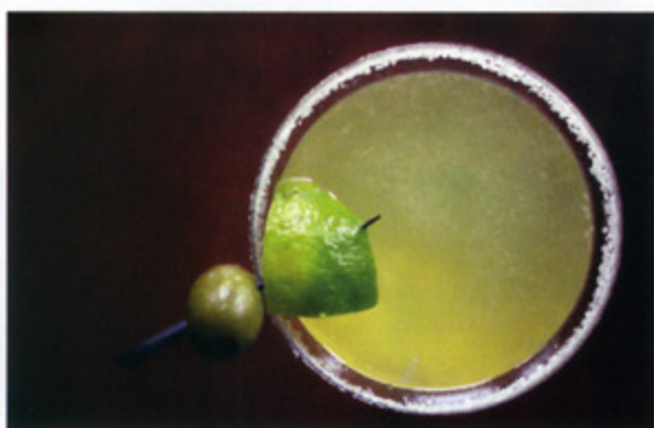
Kevin Sullivan / Orange County Home

definitely a required space for any home with enough square footage."